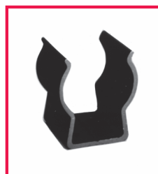
8012C Mounting Clip

Gas traps should be mounted in a vertical position to ensure proper contact of the gas with the adsorbent. Use model 8012C mounting clip with 6300 Series oxygen trap.